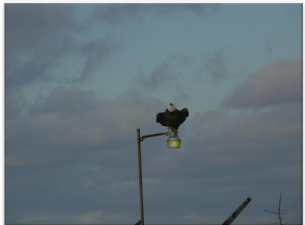
Bald Eagle checks out the modern day Digbys between catching seagull snacks.